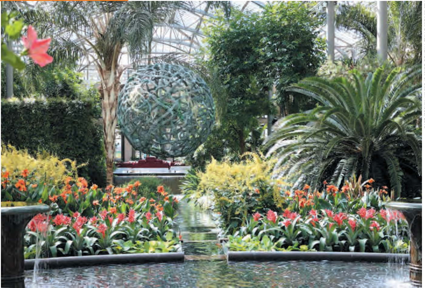
● Part of the extensive Longwood Gardens