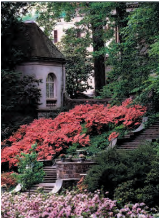
● The grounds of the Winterthur Mansion and Museum are ablaze with blooms each spring.