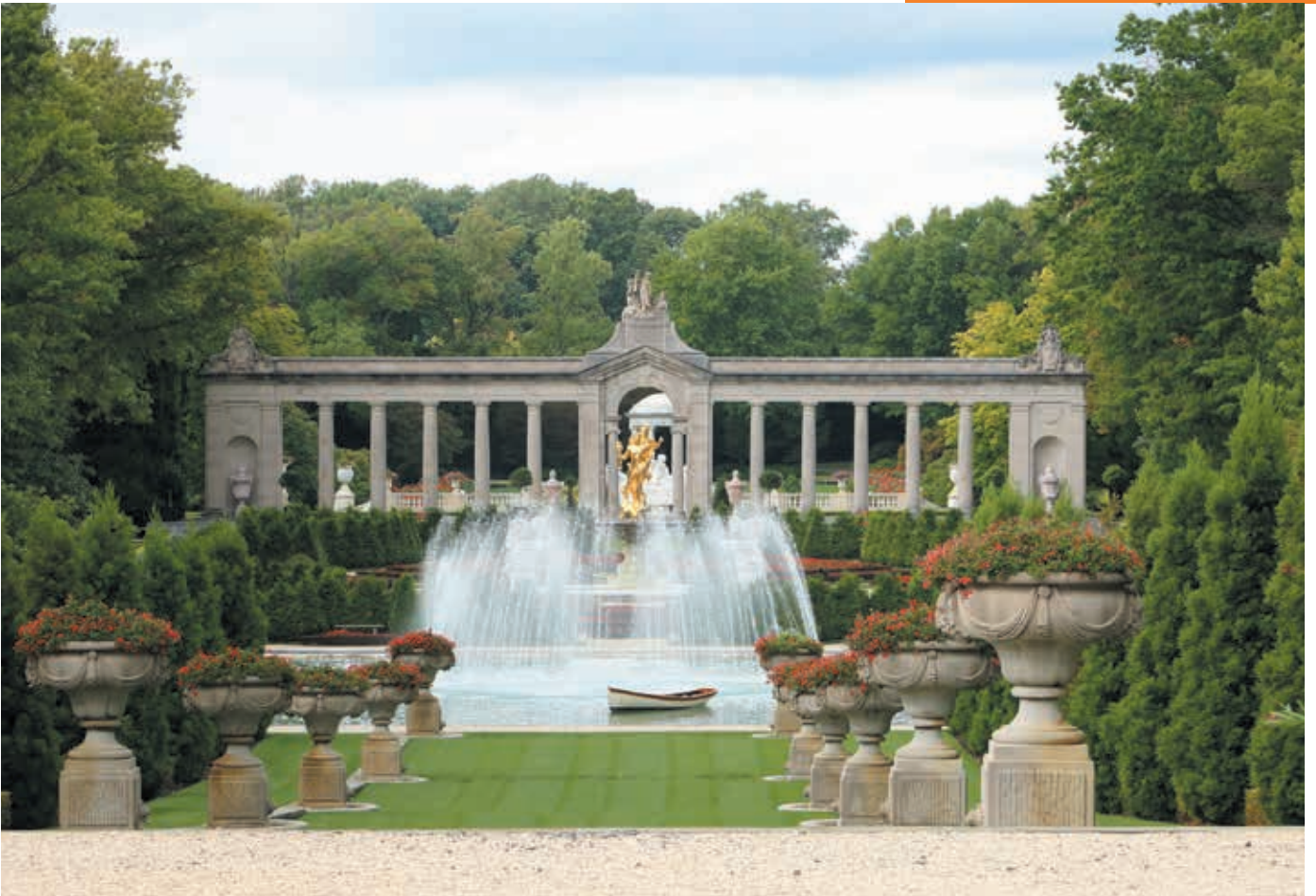
● The impressive fountain at Winterthur.