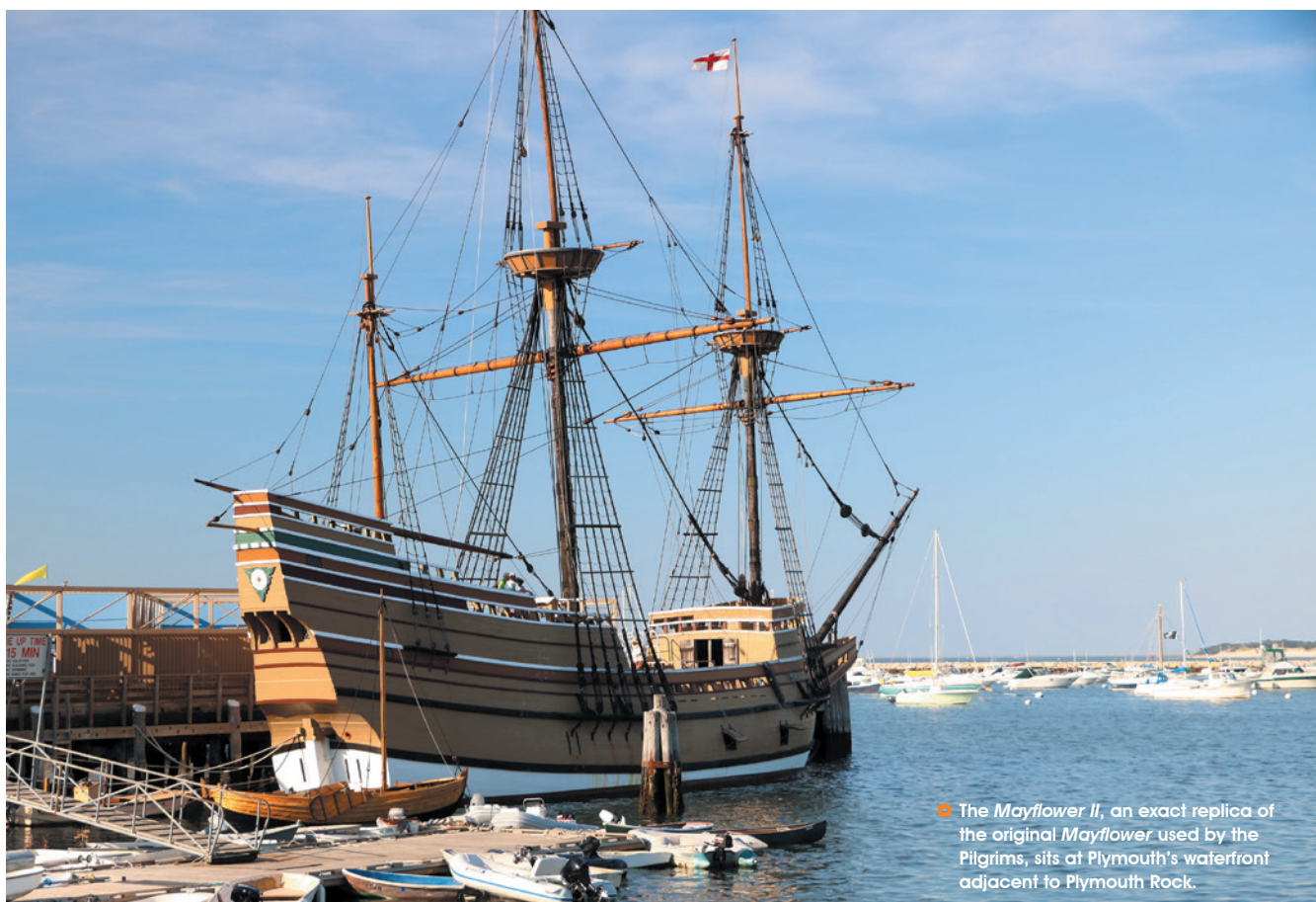
• The Mayflower II , an exact replica of the original Mayflower used by the Pilgrims, sits at Plymouth's waterfront adjacent to Plymouth Rock.