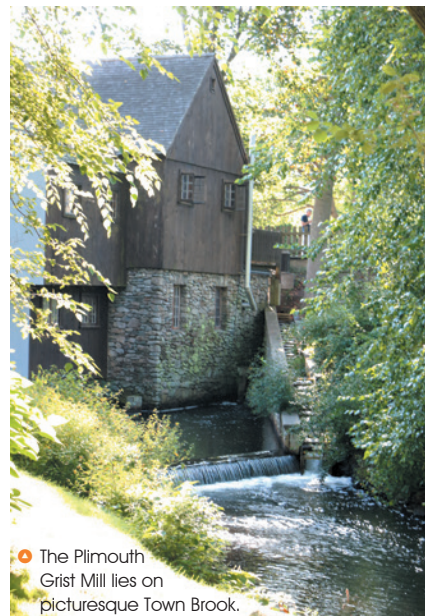
• The Plimouth Grist Mill lies on picturesque Town Brook.