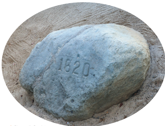
• Plymouth Rock is surrounded by a monument and sits right on Water Street in downtown Plymouth.

Throw in pretty scenery, a nice restaurant scene and proximity to Cape Cod and Boston and Plymouth should definitely earn a place on the simply smart traveler's travel bucket list for Northeast U.S.A.