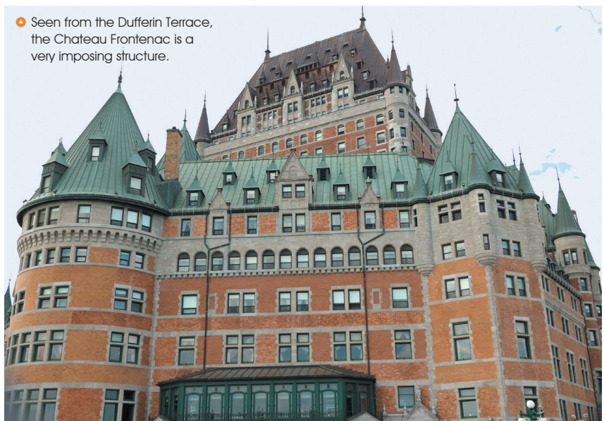
• Seen from the Dufferin Terrace, the Chateau Frontenac is a very imposing structure.